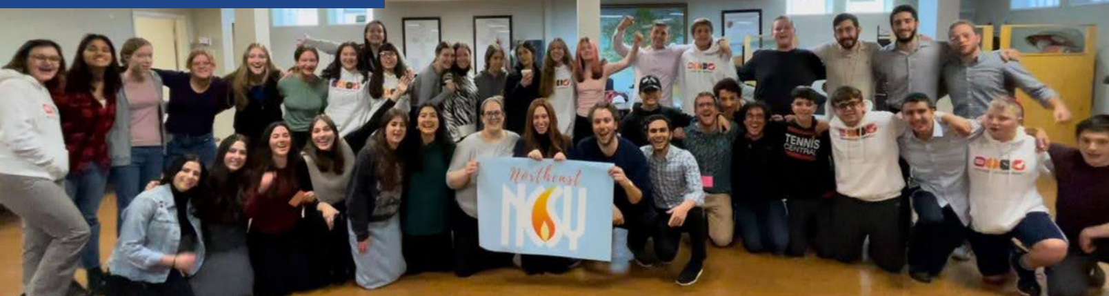
Northeast fellows gather together with teens from across the region for Shabbaton