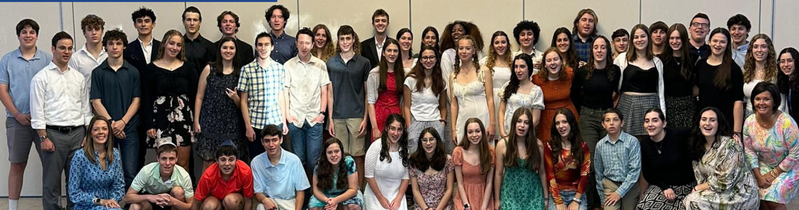
Fellows in Charlotte, North Carolina come together for Shabbos