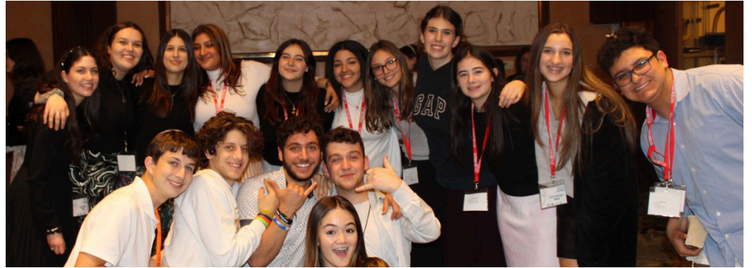
Shevet Glaubach Fellows and teens on winter regional