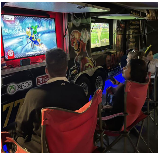
Shevet Glaubach Hollywood Fellows celebrating Purim