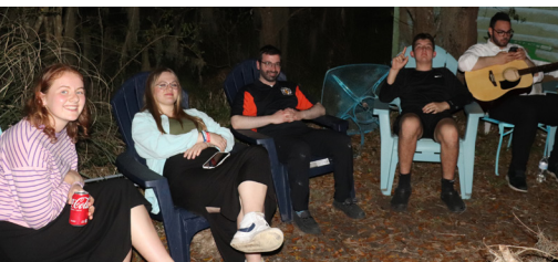
Saturday night bonfire with Shevet Glaubach Fellows