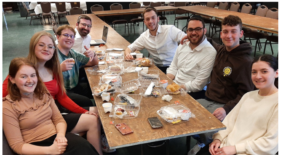
Greater South Fellows planning and debriefing after a shabbaton