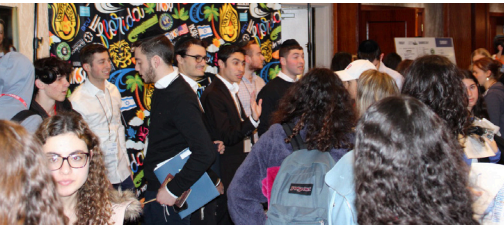
Ruach at winter regional