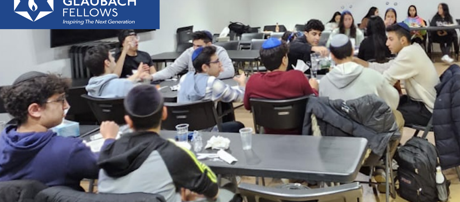
Great Neck Shevet Glaubach Fellows and teens celebrate Purim