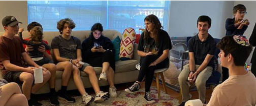
Teens and Shevet Glaubach Fellows at Orlando Shabbaton