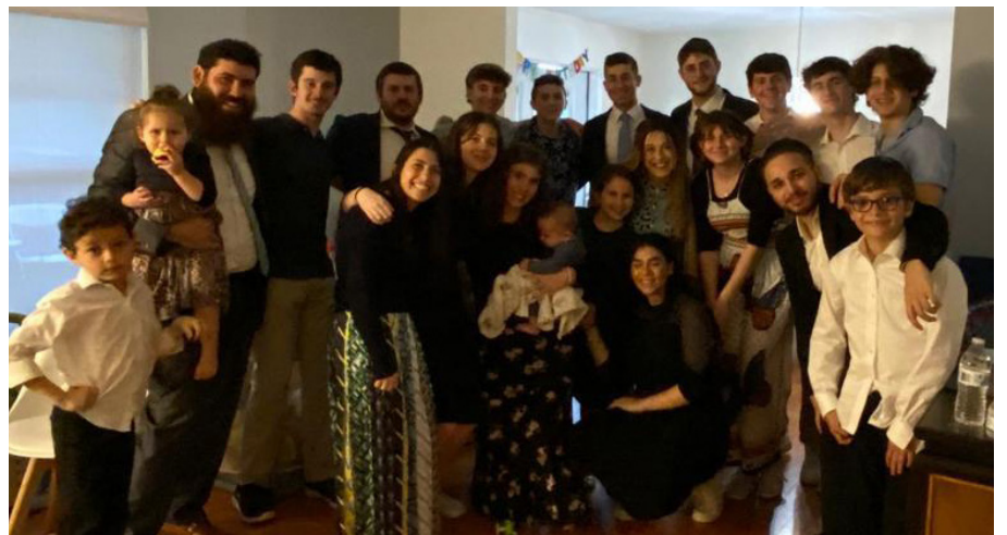
Orlando Shabbaton with Shevet Glaubach Fellows