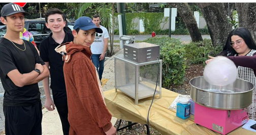
Hollywood chapter celebrating Purim with their Shevet Glaubach Fellows