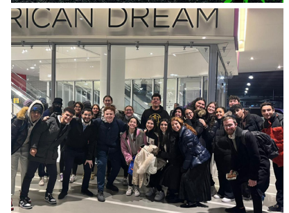
5T trip to American Dream Mall with SGF