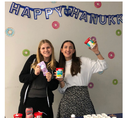
Fellows set up for Jacksonville Chanukah Party