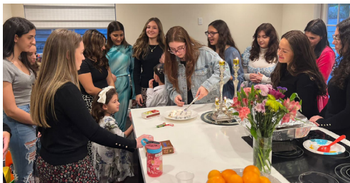
Getting ready for Shabbos in Hollywood