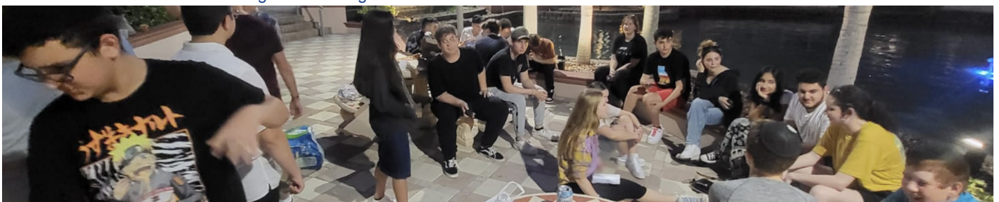
Boca Raton weeknight learning