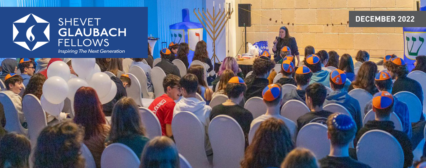
Fellows join in Brooklyn for a Mega Chanukah Event