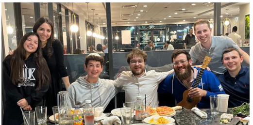
Fellows planning and strategizing together