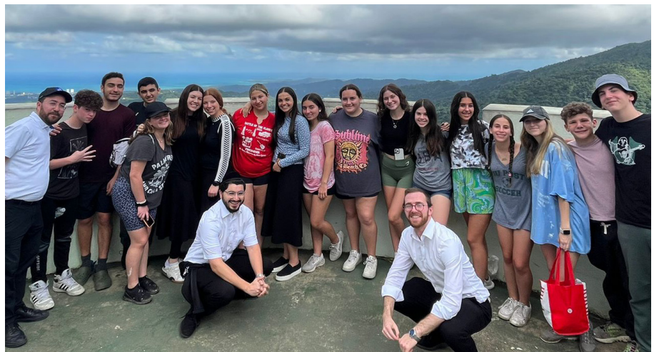
Chesed Mission with NY Fellows