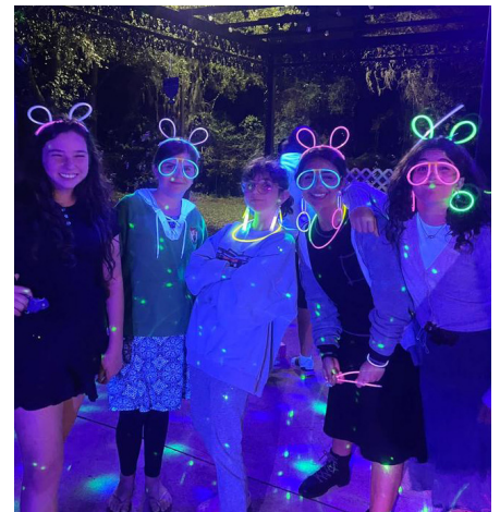
Jacksonville Channukah Party