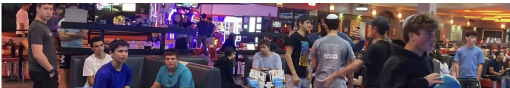
Night out bowling with fellows