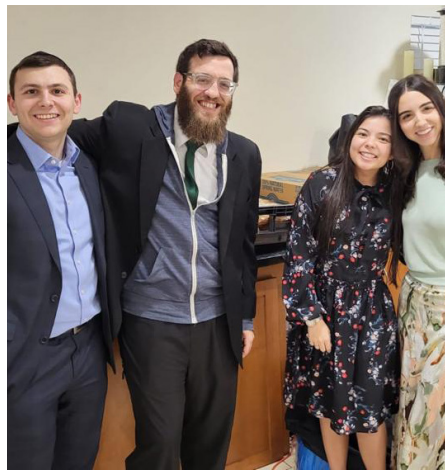
Boca Raton Fellows getting ready for Shabbos