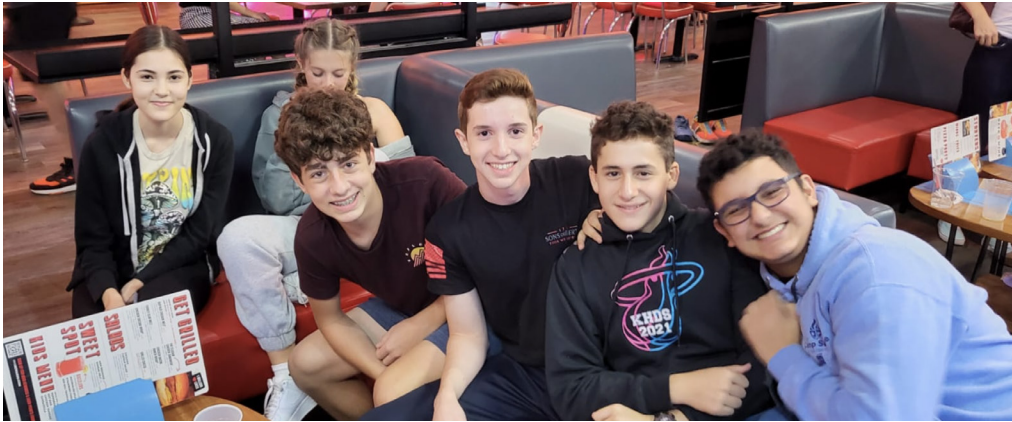
Bowling night with Fellows in Boca Raton