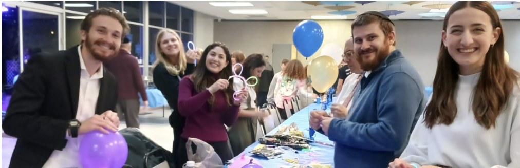
Fellows prepping for Jacksonville