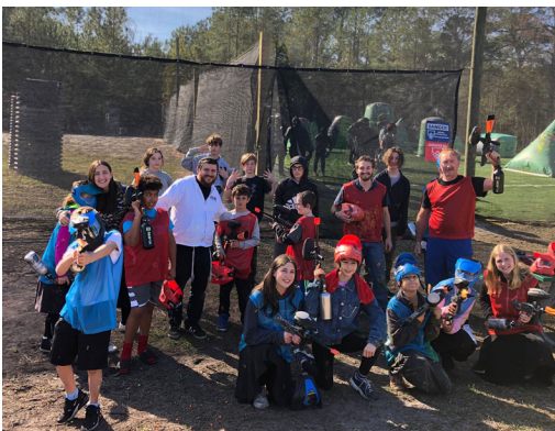
SGF Emtza in Jacksonville