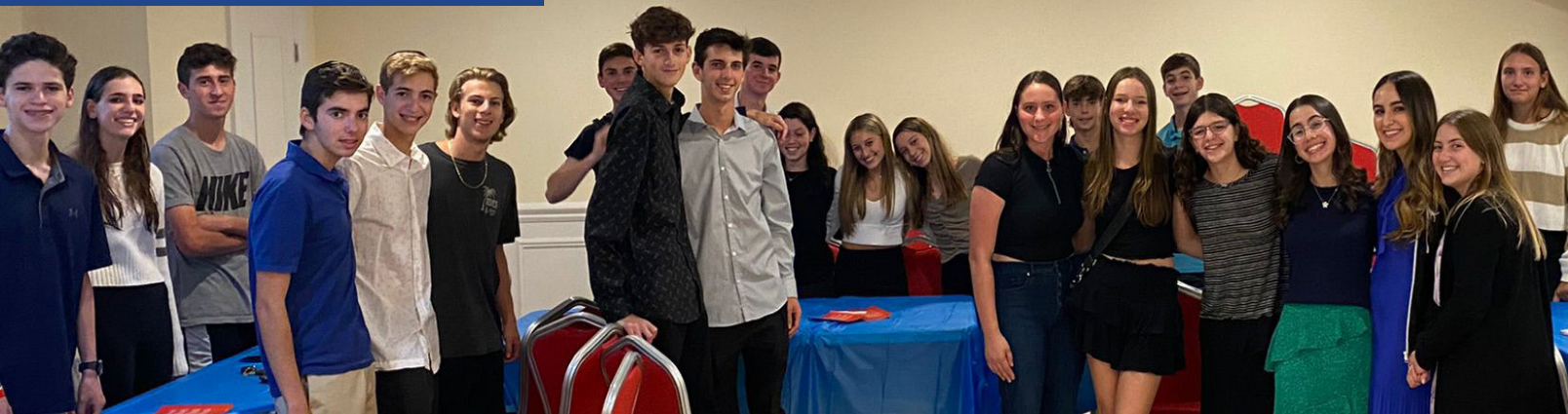
Plainview Shabbaton with Shevet Glaubach Fellows