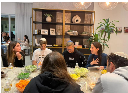
Shevet Glaubach Fellows and JSU Private_Latin community get together