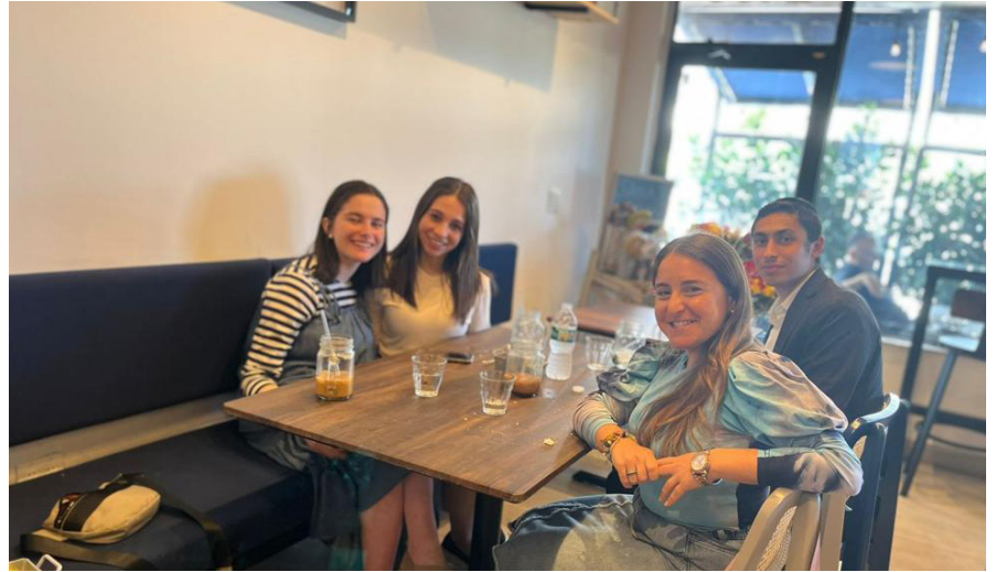
Shevet Glaubach Fellows and community directors planning