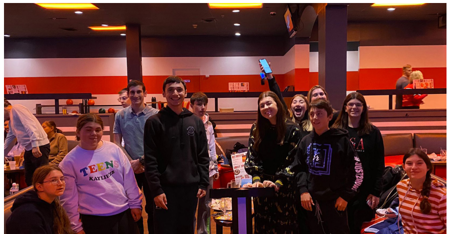
SGF and ncsyers spend shabbos together in Plainview