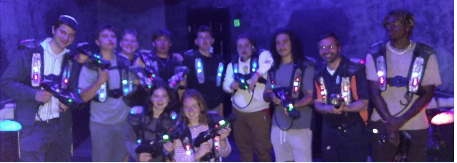
Savannah Shabbaton Motzei Shabbos fun with Shevet Glaubach Fellows