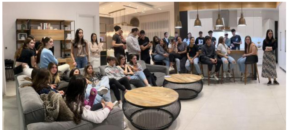
Shevet Glaubach Fellows led a discussions with JSU Private students