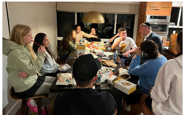
Fellows and teens build their own sukkahs!