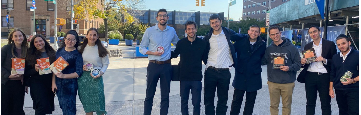
SGF Southern Advisor Shabbaton Kick Off