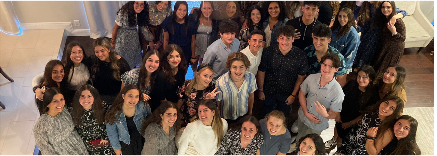
TJJ Fellows in Florida on Geula Shabbaton