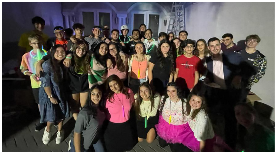
Celebrating Sukkos in Hollywood