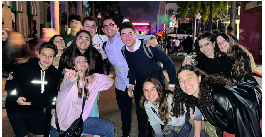
Miami Fellows and their Teens