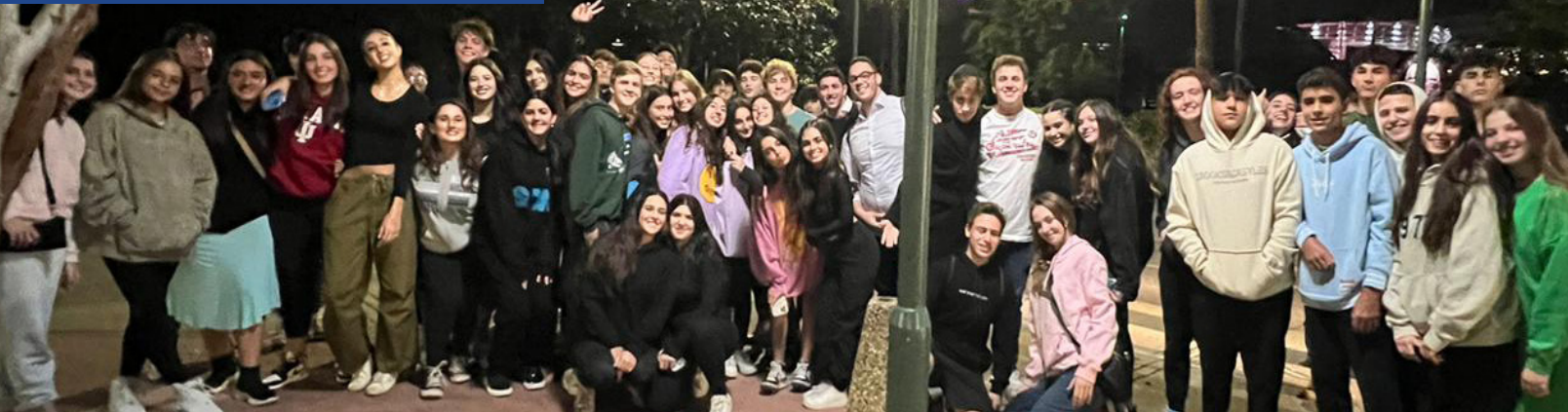
Miami Fellows and Teens join together