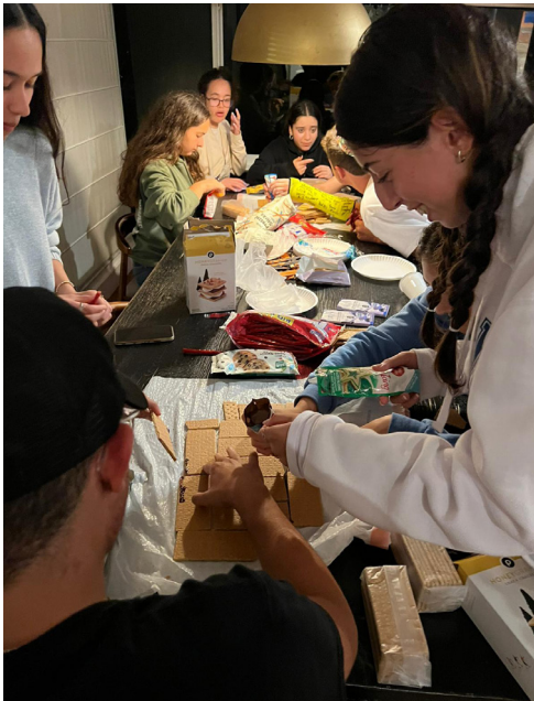
Edible sukkah making