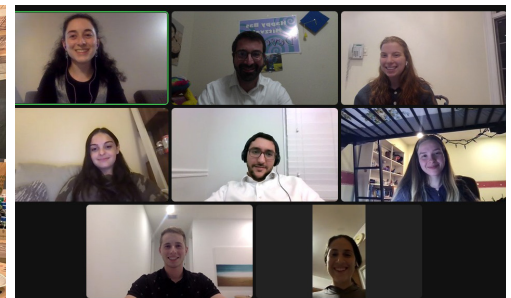
Greater South Torah Learning with SGF