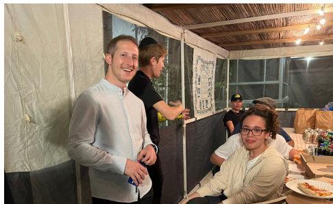
Southern Fellows and teens spending time in the Sukkah