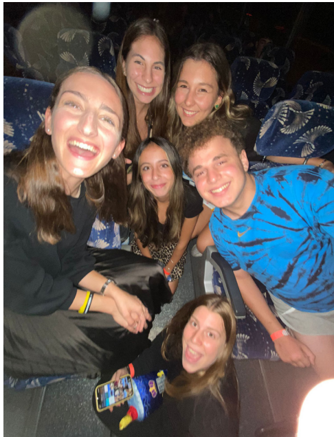
Miami Fellows and Teens