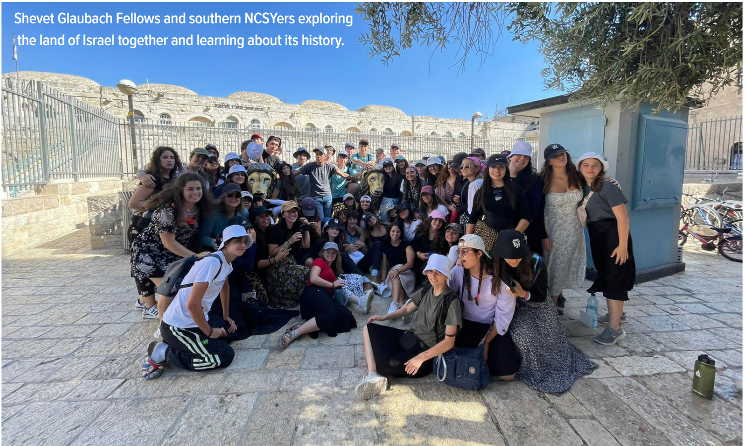
Shevet Glaubach Fellows and southern NCSYers exploring the land of Israel together and learning about its history.

In our modern society, it is very hard for teens to accept the fact that they are Jewish and that they can do something meaningful with their identity. Through NCSY and Shevet Glaubach, you have been able to give grounding and meaning to these teens by connecting them to amazing advisors who exemplify the meaning of a proud Jewish identity.