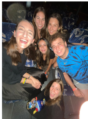
Fellows and teens come together for the first Geula Shabbaton of the year