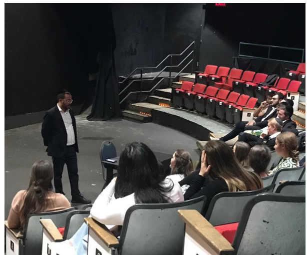
New York Training Session