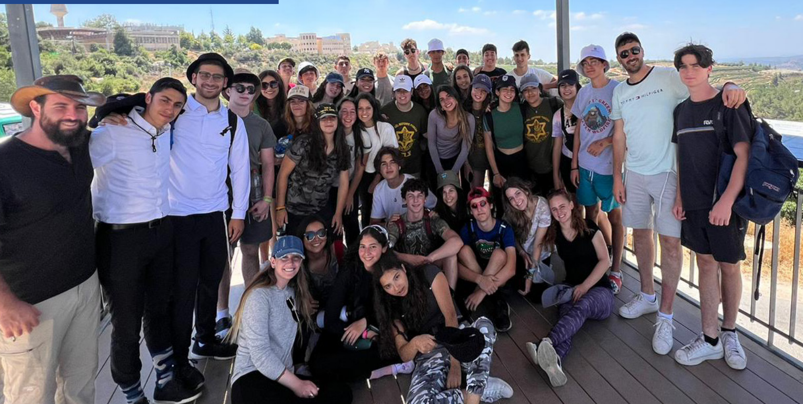
Shevet Glaubach Fellows and southern NCSYers exploring the land of Israel together and learning about its history.