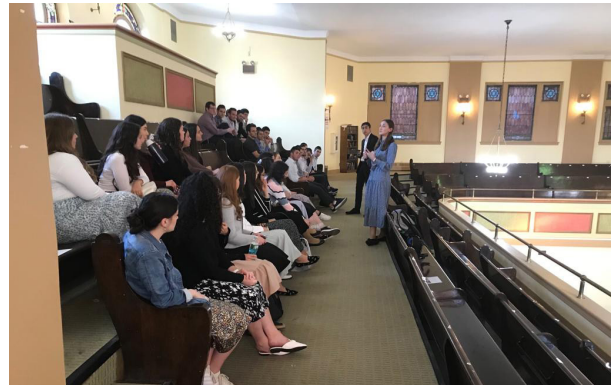
Southern Training Session