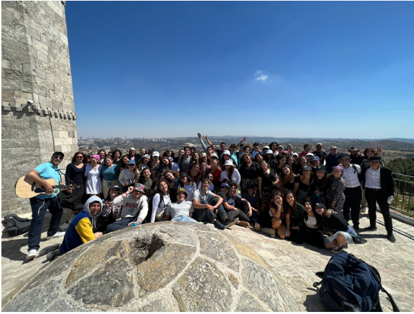
Shevet Glaubach Fellows and NCSYers in Israel

NCSY Shevet Glaubach Fellow and Advisor Kickoff