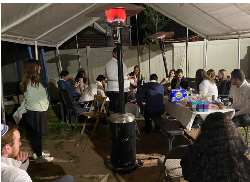
Havdalah with Shevet Glaubach Fellows and Regional Board