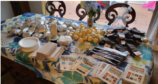
Boca chapter Matzah bake with Shevet Glaubach fellows