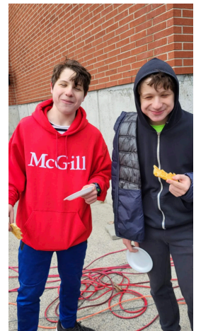
Shevet Glaubach Fellows help prepare for Pesach with their teens in Ottawa