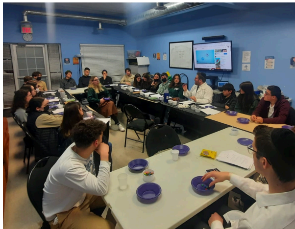
Ottawa NCSY Pre Pesach Seder with Shevet Glaubach Fellows