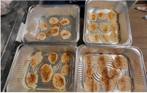
Boca chapter Matzah bake with Shevet Glaubach fellows