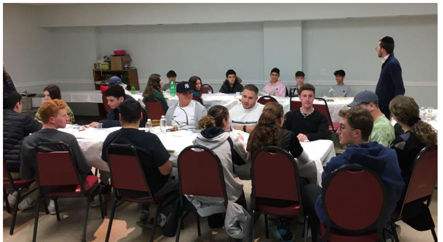
Fellows lead Seders in the Five Towns