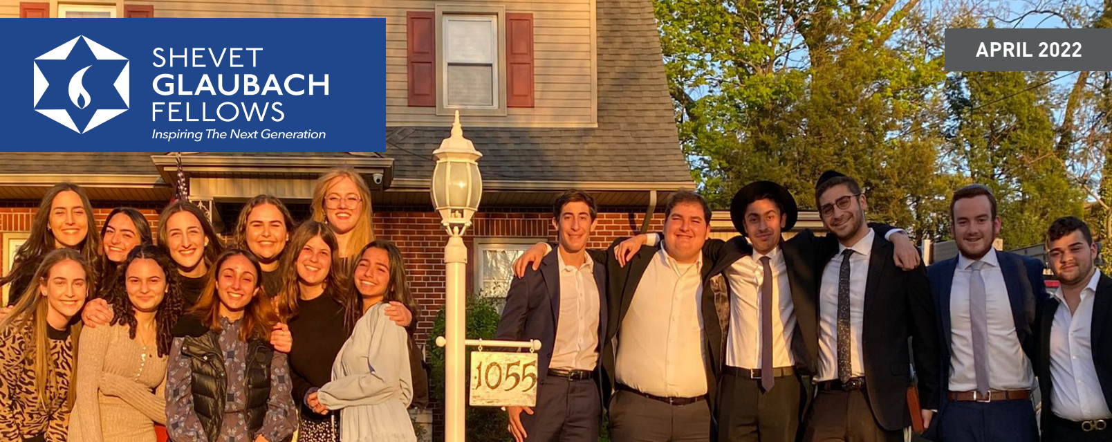
Southern NCSY Regional Board with Shevet Glaubach Fellows at Shabbaton